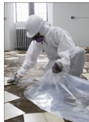
Protected worker removing asbestos flooring